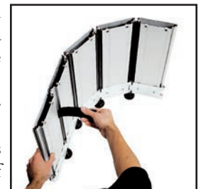
Integral rubber weatherseal