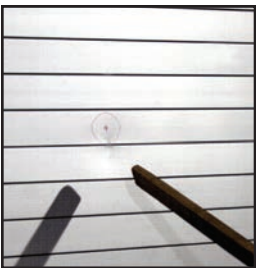
Heavy-duty panel built to withstand missile impacts in high velocity wind zones.